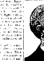
Portrait of a man, likely related to the 'Dear Friends' text.